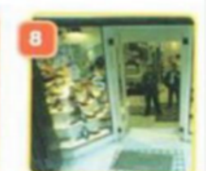
Fruit & vegetable stall Butcher Clothes shop Shoe shop