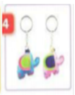
Chicken Fish Bread Water Post card Key rings