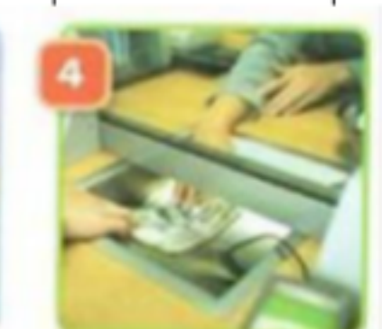
Bakery Toy shop Pharmacy Bank