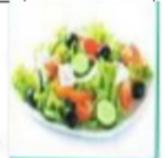
Cherries Karate Basketball Intelligent Salad