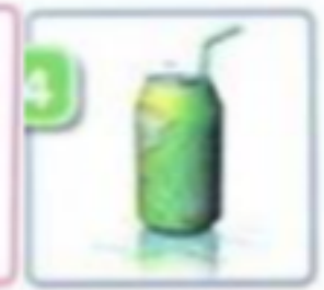
Tin of lemonade